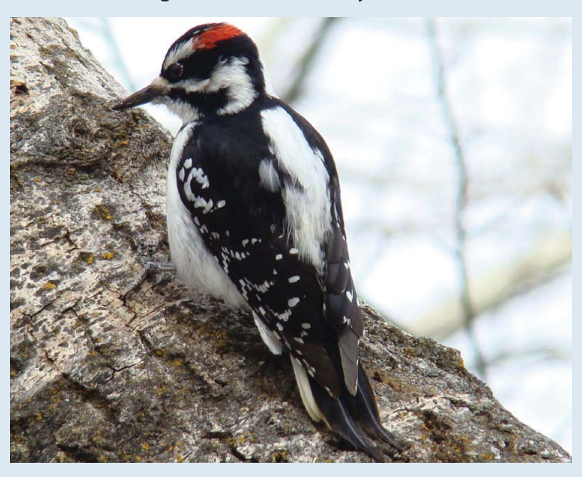
Hairy woodpecker

The following people made direct donations, purchased or renewed a wildlife license plate, or let us know of a tax check-off donation between October through December 2010. This list represents those who marked the contributor box when they donated to the Conservation Sciences Program. However, many subscribers not listed here have contributed generously and Idaho's nongame wildlife thanks you ALL!