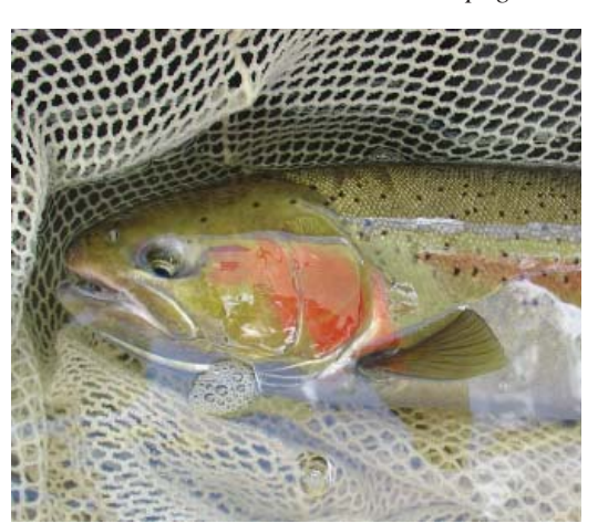
Adult steelhead