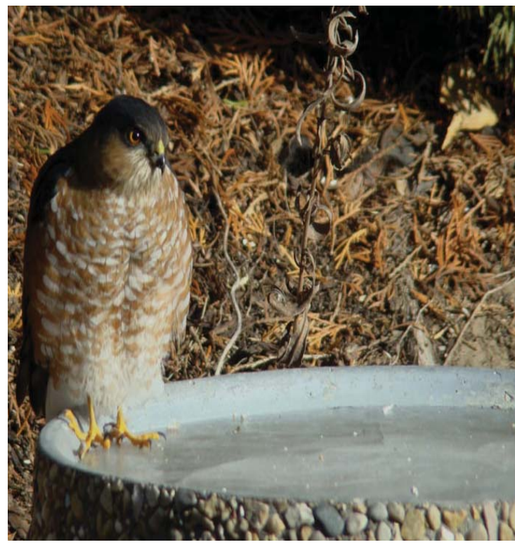
A backyard visitor (sharp-shinned hawk); © Terry Gray.