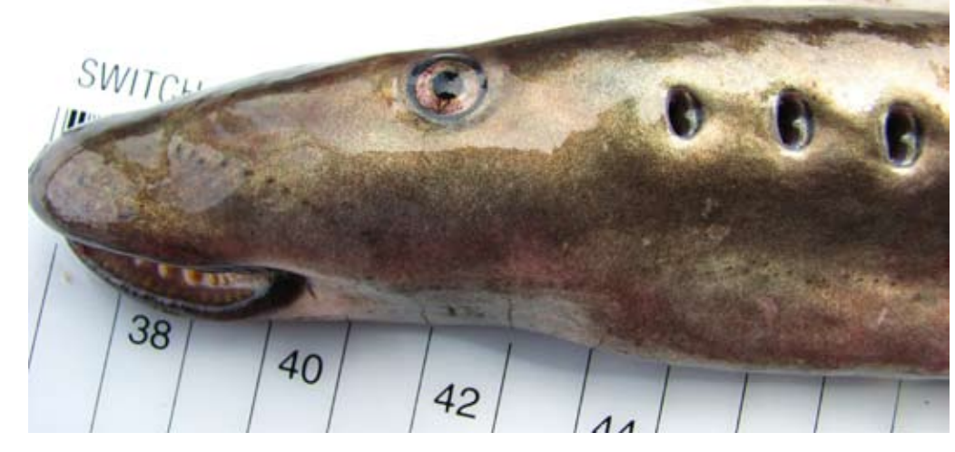
A close-up view of the Pacific lamprey

Like salmon, Pacific lamprey die after spawning. After hatching, young Pacific lamprey (now called ammocoetes) rear in soft stream bottom material for up to seven years while filter feeding on organic matter. After this extended freshwater rearing phase they transform into an adult-like form, complete with parasitic-adapted mouth, called a macropthalmia. This phase migrates downstream headed to the Pacific Ocean where they attach themselves to a variety of marine fish and mammals with its teeth. Their sharp-edged tongue is used to make a hole in their host animal which allows the lamprey to feed on blood and other bodily fluids. In the marine environment these macropthalmia rear and grow into adults for a period of one or two years before they begin their migration to freshwater spawning grounds in Idaho streams.