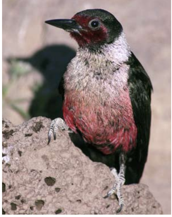
Lewis's woodpecker; © Dave Menke, USFWS

Key conservation measures for the Lewis's woodpecker include retention of mature trees, large diameter snags, and a welldeveloped understory in ponderosa pine. riparian cottonwood, and mixed conifer forests. In ponderosa pine forests, periodic low-intensity burns or selective thinning will help maintain the open forest structure and arthropod abundance preferred by Lewis's woodpeckers. In cottonwood forests, local ordinances that establish adequate building setbacks and retention of riparian vegetation will help restore floodplain functions needed for cottonwood regeneration. With widespread public and private support, perhaps these conservation measures will become the "usual" for this particularly unusual woodpecker.